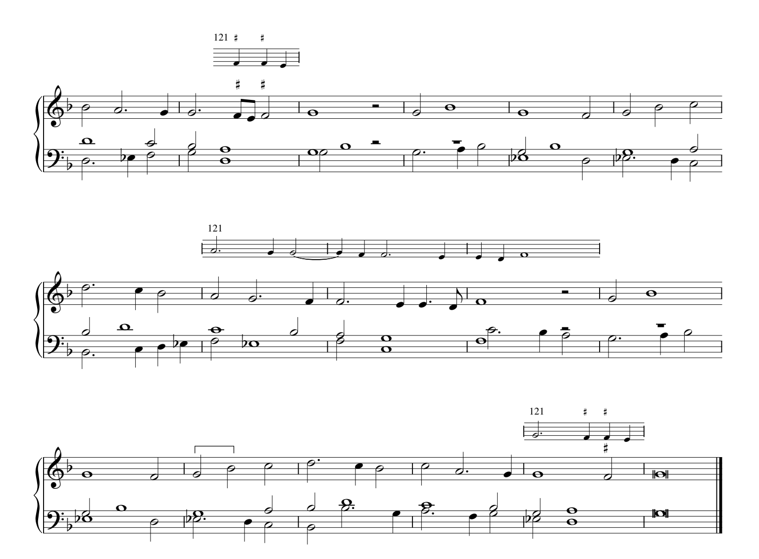
Bar 1-16 is the refrain; then follow three stanzas, alternating with the refrain, and finally the refrain is to be repeated. So play the whole piece one, two or three times and end with bar 1-16.