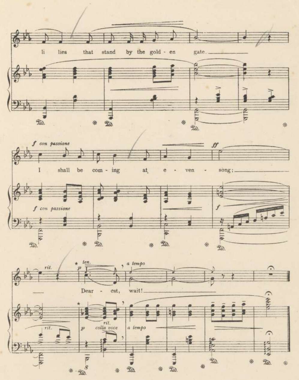
If if small notes are used