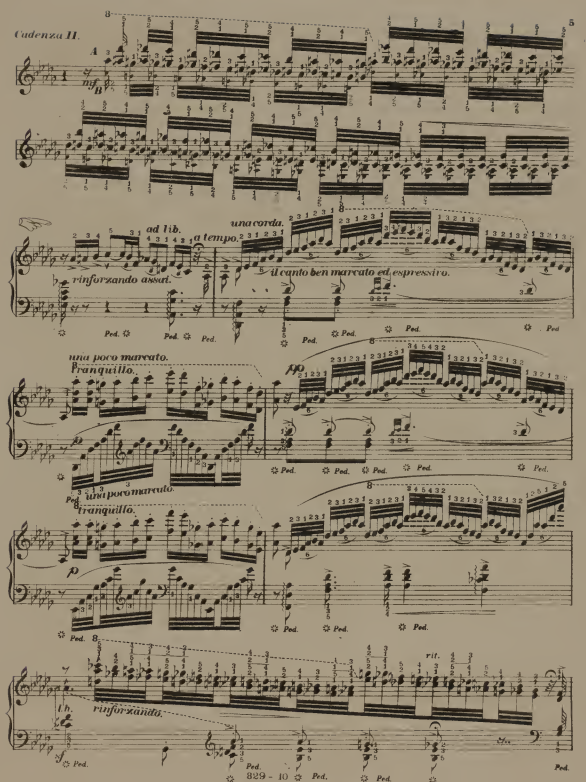
The small notes may be omitted_in that case use fingering at A.Mhenthe small notes are played use the fingering at B. '