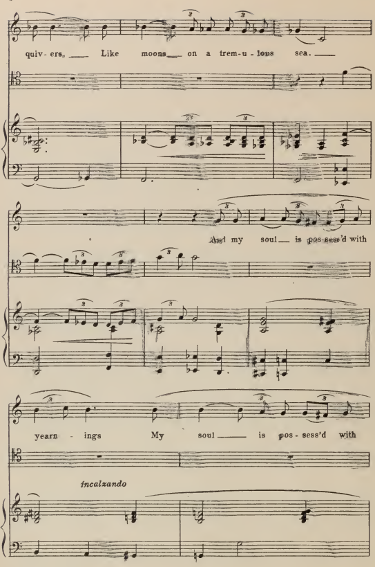
A Vision of Music