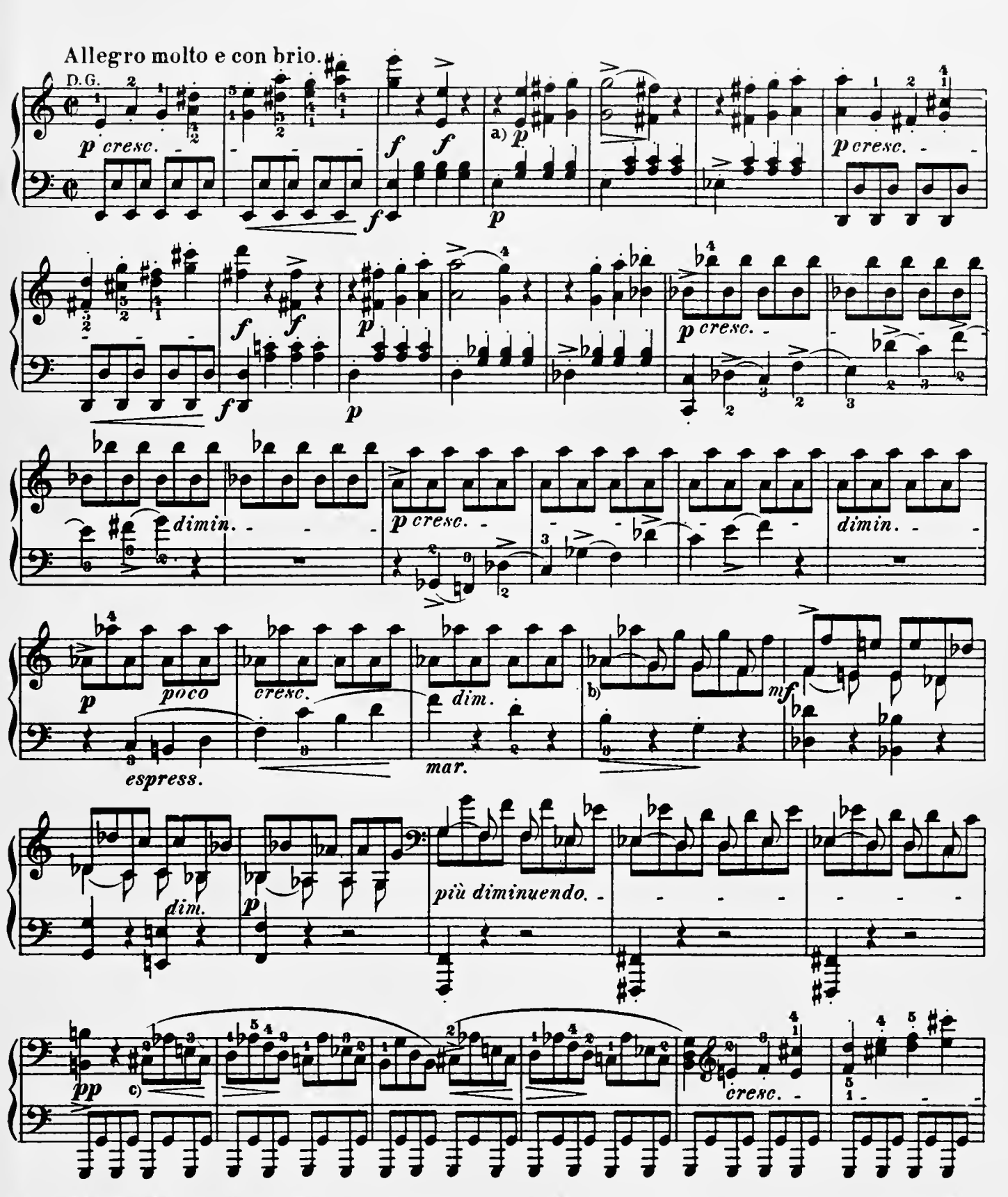
a) Despite the identity of this phrase with that In meas. 5 of the first Grare , it must now be played with a wholly different expression ______ or, rather, with none whatever, this being rendered necessary by the doubled rapidity of the movement () in the Grare = 0 in the Allegro ).

b) Although the phrasing \frac{1}{2} etc. would more nearly correspond to the original form of this passage in meas. 7 et seq. of the so-called second subject (Eb-minor), it would not be in keeping with the general (progressional) character of the development-section.