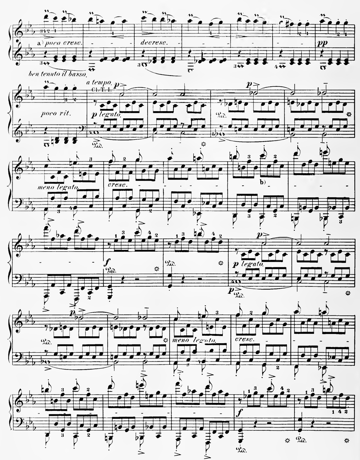
a) In the original the decrescendu begins at this measure, which seems to us rather too prolonged for 6 full measures, — the more so, because an actual furte would be inadmissible in the preceding; for this reason we consider a puce crese. more suitable for the first two measures.

b) Take care not to play E_{b} instead of F in the right hand, as a C-minor chord is out of the question here; the C in both Soprano and Bass is simply a passing-note of the dominant chord.