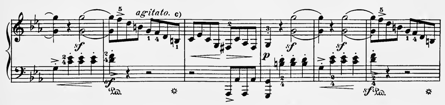
a) The relation between the movement of the Introduction and the Allegro is properly this: That a whole note in the latter is exactly equivalent to an eighth-note in the former. Consequently, the Allegro may be begun at the rate of M.M.d=132, which movement would not, however, be fast enough further on, in view of the passionate character developed.

b) In tremolo-figures like these, the player should be content to mark only such bass notes (and then only at the first stroke) as indicate a new progression in the harmony.