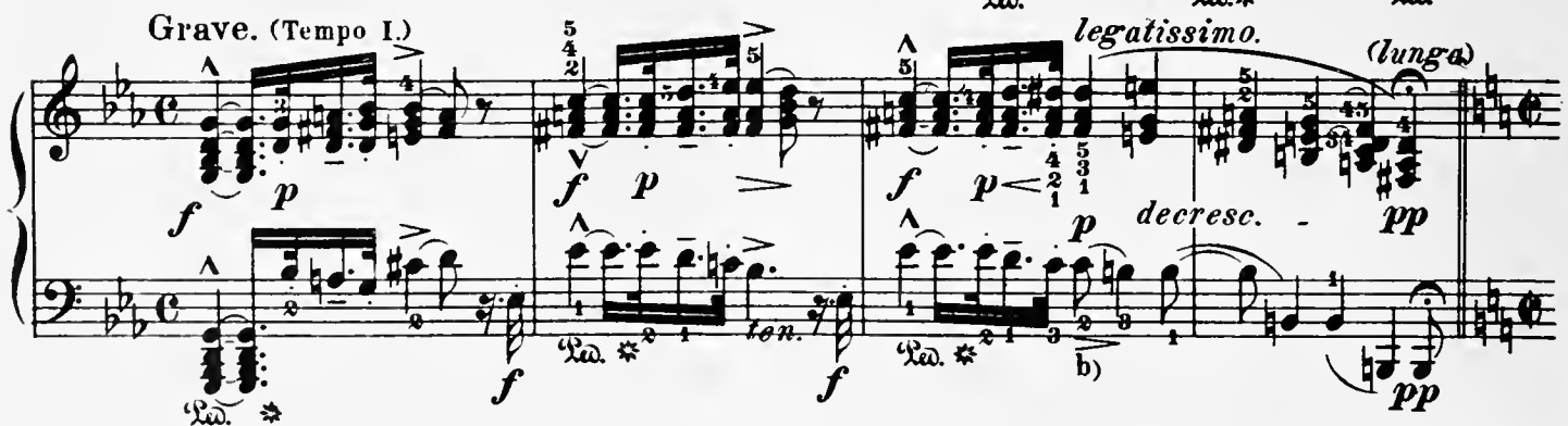
a) The hold (pause) must be sustained precisely 3 measures, so as to form another 4- measure period. But a quarter - rest should precede the reprise of the first division:

b) Retard the entrance of the B in the bass, in order to enhance the pleasurable suspense attendant upon the enharmonic change of the diminished chord of the seventh in the transition from G-minor to E-minor; and play the following passage throughout with full dreamy freedom. 12589