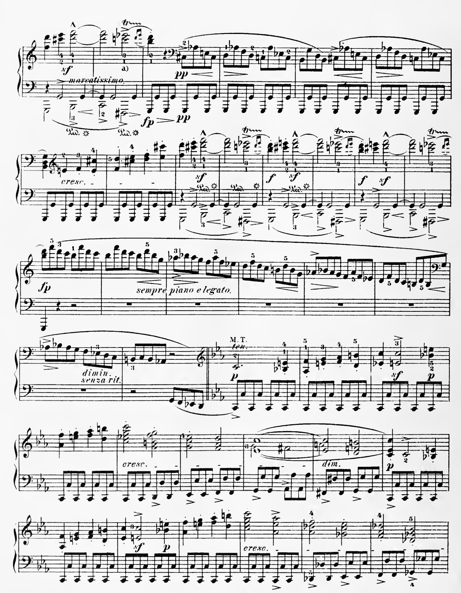
a) As an exception to the rule, this trill must not begin on the auxiliary, so as not to blur the melodic outlines: seven notes vigorously played suffice in such rapid tempo.