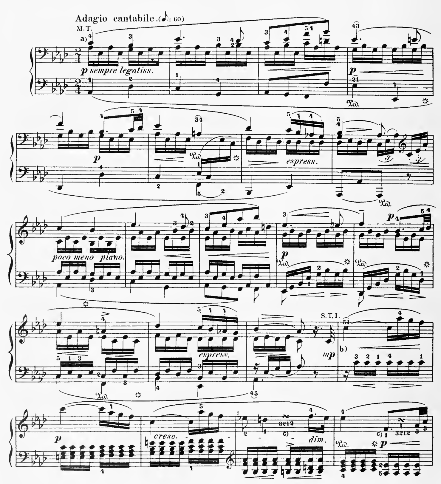
a) To the best of our knowledge no one has yet remarked the striking affinity of the theme of this movement, even with reference to its external melodic structure, to that of one of the loftiest Adagias of grandest scope from the Master's last period; we mean the Adagia of the Ninth Symphony, written almost a quarter of a century later. The performance of both demands an equally inspired mood. The player's task, to "make his fingers sing," may perhaps necessitate a more frequent use of the pedal than we have indicated, which must of course be controlled by a most watchful ear.

b) This first middle section of the Rondo (for such this Adagia is in form) may be taken slightly mena andante, i.e., slower; but no more so than needful (so as not to drag), and therefore, in only a few places.