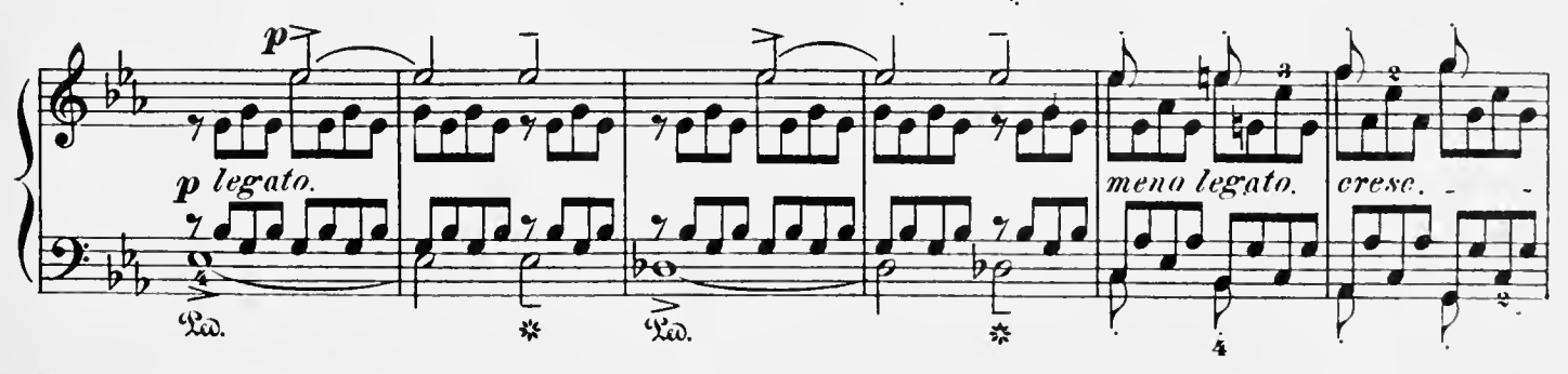
a) These first 4 measures are to be played without the least retardation, yet very quietly, and with no accentuation of the accompaniment. 12589