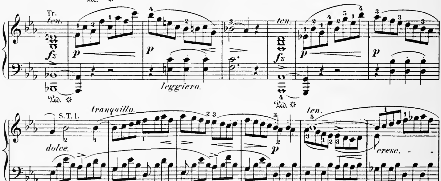
a) Although this third movement is less "pathetic" than the preceding ones, the player alone will be to blame should the Pathetic Sonata end apathetically. The original, to be sure, contains only the most indispensable expression-marks, which it has been the aim of our Edition to supplement efficiently; as, for example, by the crescendo ending piano in measures 2-3, by emphasizing the distinction to be made, in the figures for the left hand, between the parts (tones) which are essential (independent) organic elements, and those which are mere harmonic filling; etc.

b) In executing this grace, the player must be careful not to produce the effect of parallel octaves with the bass (\mathbf{F}-\mathbf{Ab}, \mathbf{and} \text{ in the next measure } \mathbf{Eb}-\mathbf{G}) ; rather than this, the slide might be treated as an appendage to the foregoing notes.