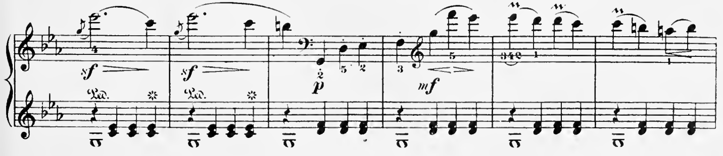
a) This piano must enter abruptly, which requires some practice, especially with the left hand; similarly in the parallel passage 4 measures further on. 12589