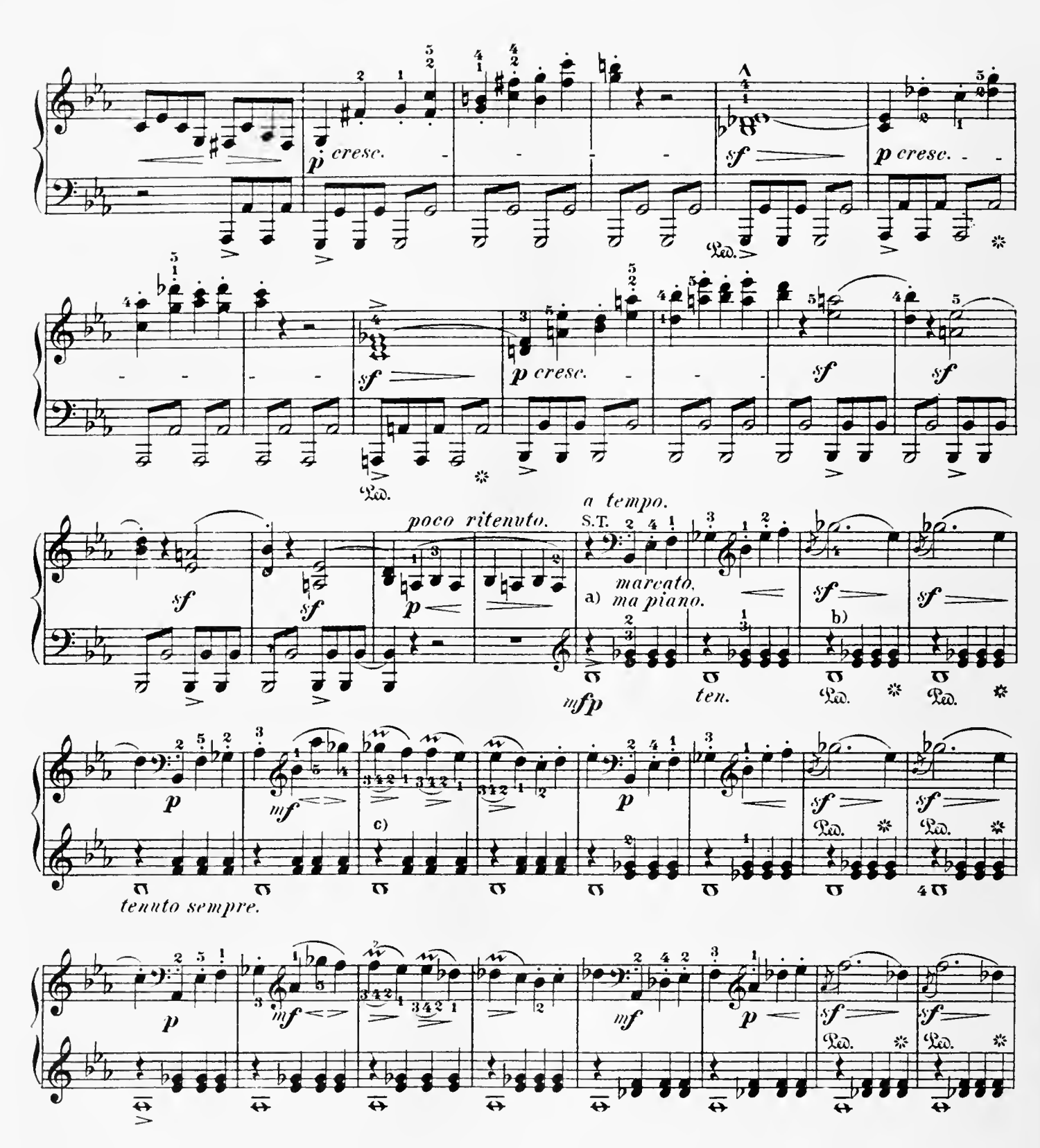
a) Although this "second" subject, too, is passionately agitated, the unvarying tempestuous sweep of the first cannot be kept up throughout. Play the first measure of each four-measure period-the preluding bass — somewhat more quietly, the following three with all the more animation; shade the 16 measures in Eb-minor'differently from the parallel passage in Db-major; in short, invest the entire dialogue with the most varied coloring possible.

b) Execution: according to the familiar rule, that all graces take their value from, and are played within, the value of the principal note.