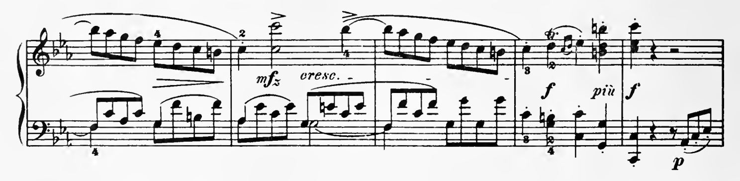
a) The fingering given by us serves to aid in executing this run with the exact rhythmic divisions desired by the composer. The hold which follows appears really superfluous; for, by the prolongation of the chord through 1_2^4 measures, all demands of the pulsing rhythm — which goes on even during the rests of a piece are fully met.