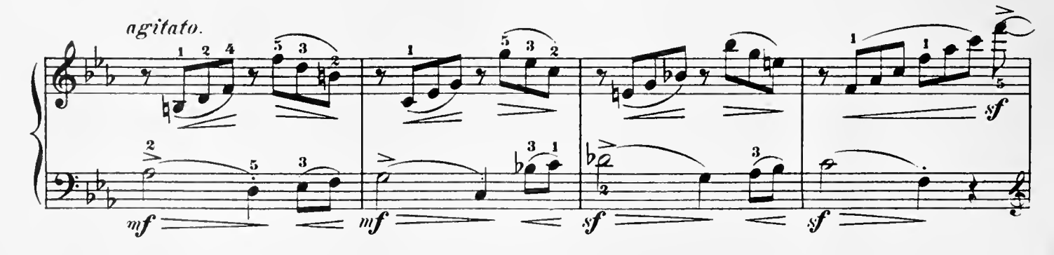
a) The more tempestuously the 12 preceding measures have been played, the longer may this hold (see Note a, page 154) be sustained.