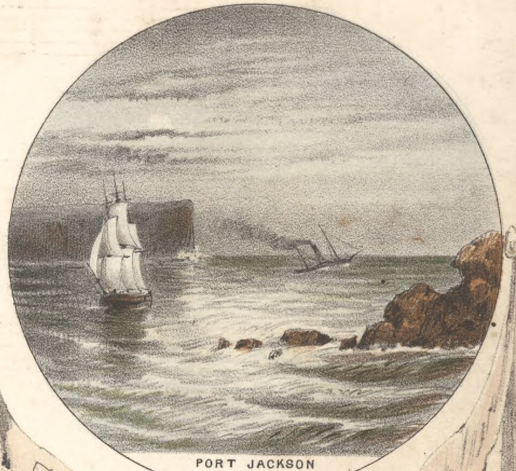
PORT JACKSON HEADS.