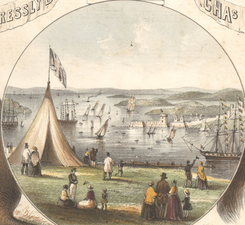
ANNIVERSARY REGATTA. SYDNEY COVE.