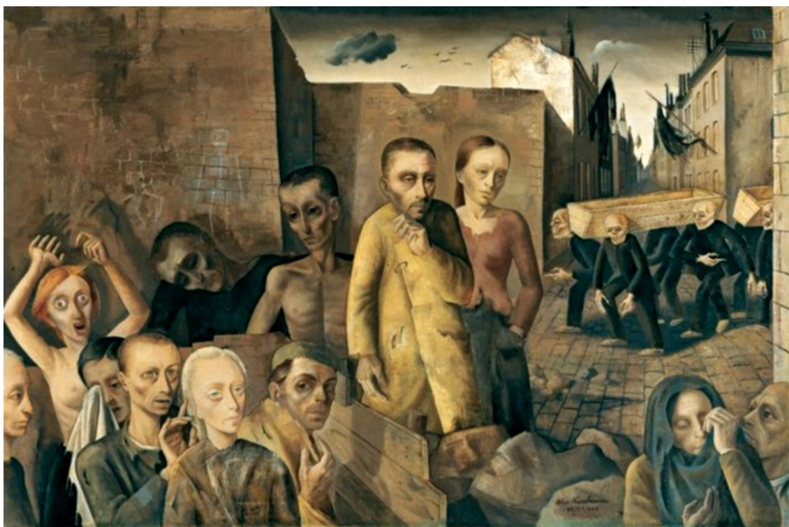
Felix Nussbaum - I dannati (1943)