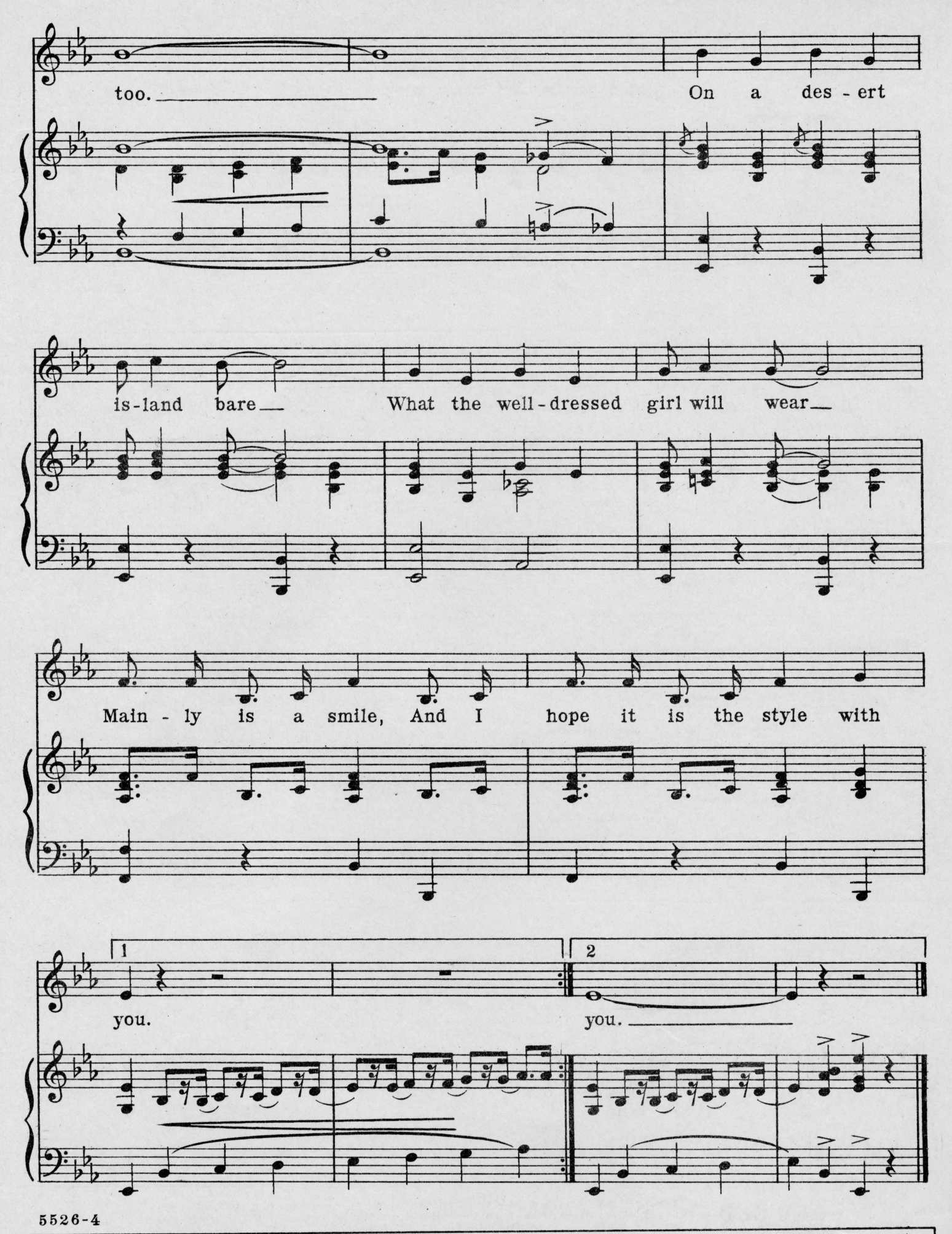
"Feist" Songs are also obtainable from your Dealer for your Talking Machine or Player Piano and for Band, Orchestra; etc.